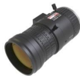
HV1140D-8MPIR 11~40mm DC Iris Lens