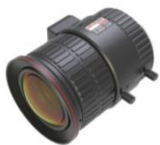
HV3816D-8MPIR 3.8~16mm DC Iris Lens