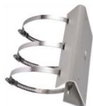
Vertical pole mount DS-1275ZJ